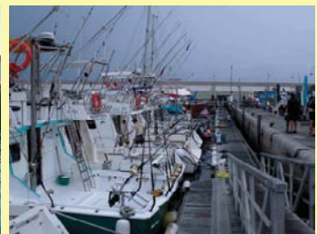
Bussines · Recreational

“Angel shark ( Squatina squatina ): locally extinct or extremely rare almost all of the remaining population is found around the Canary Islands” (Ferreti et al. 2015).