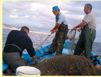
Gillnets · Professional