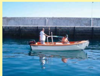
Particular · Recreational