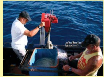
Bottom longline · Professional